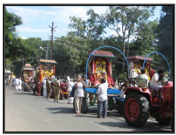
The procession going around the Hill.