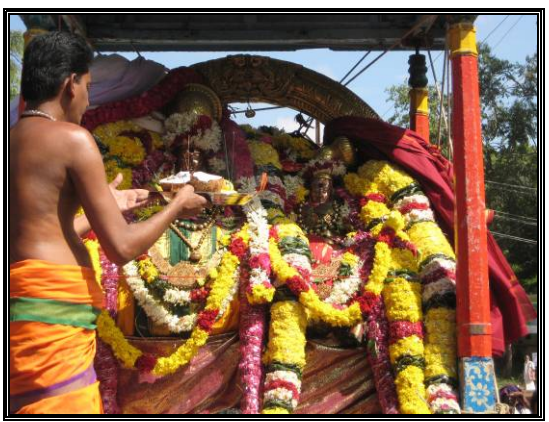
Arati being performed to the Lord.