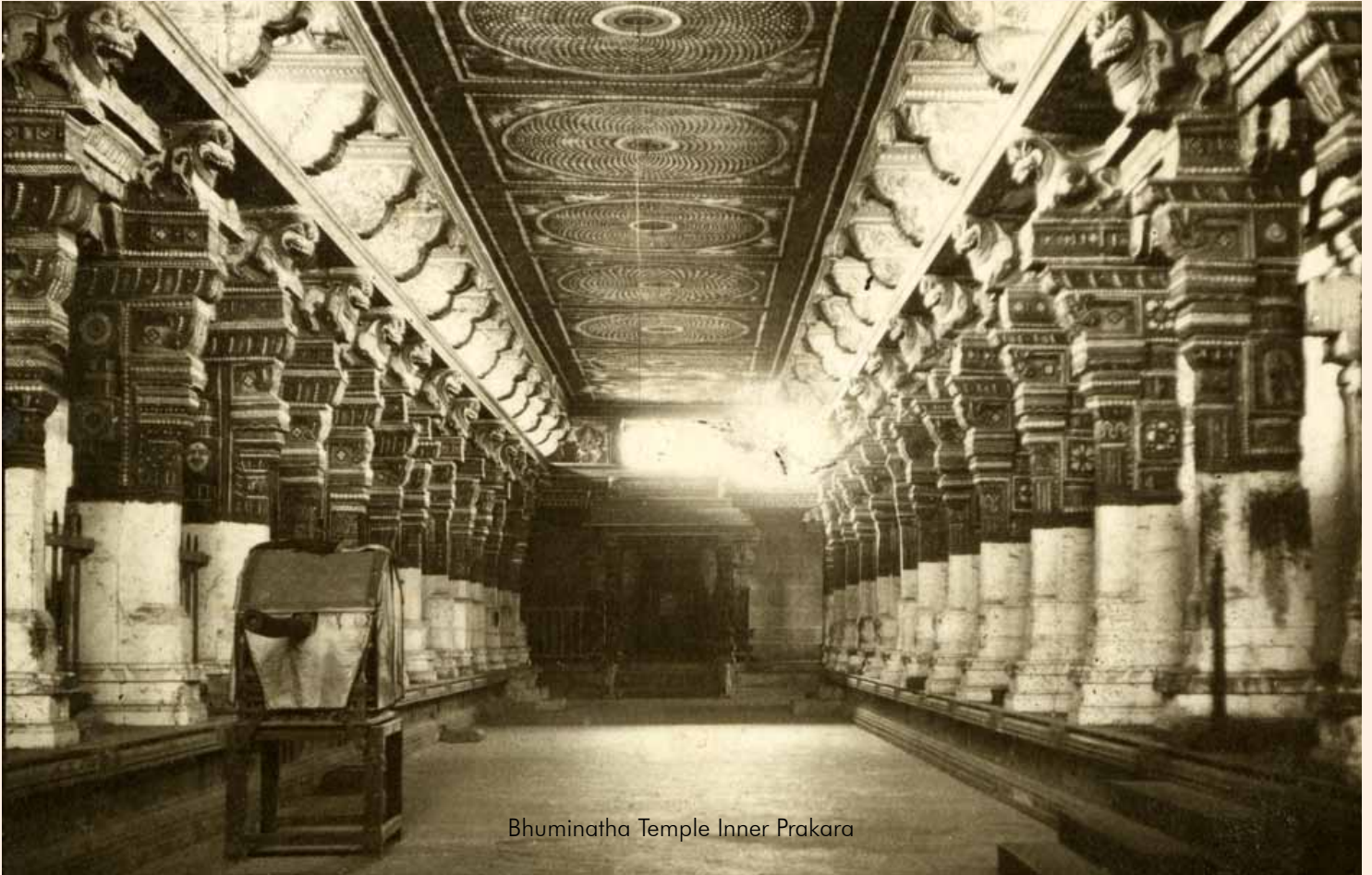
Bhuminatha Temple Inner Prakara